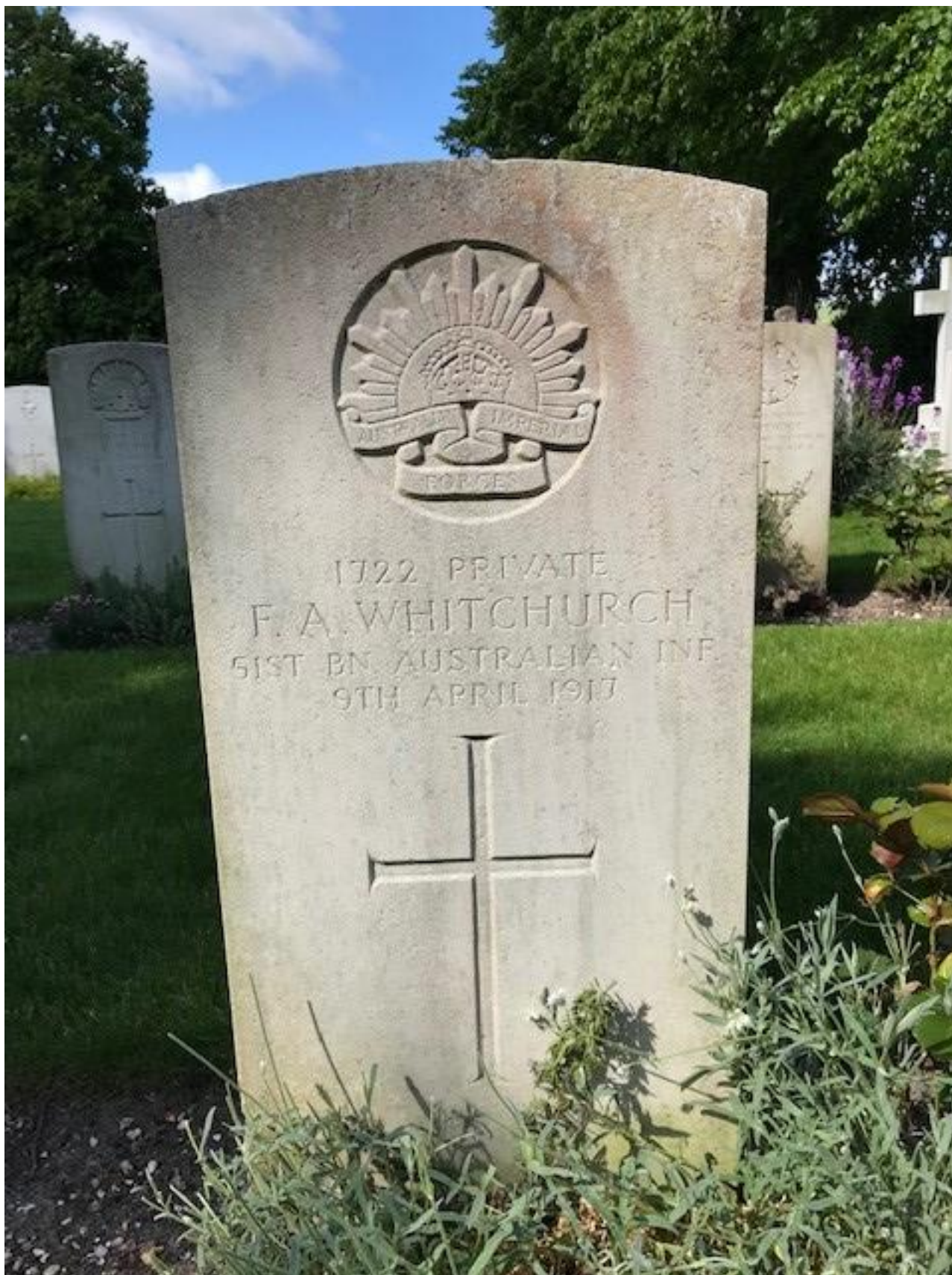
Photo of Private F. A. Whitchurch's Commonwealth War Graves Commission Headstone in St Lawrence's Churchyard, Stratford-sub-Castle, Wiltshire, England.